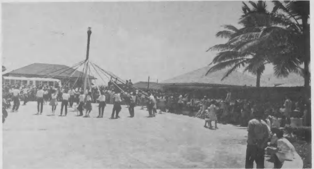
Maypole dance in Seroe Colorado - Baile di cinta na Seroe Colorado.